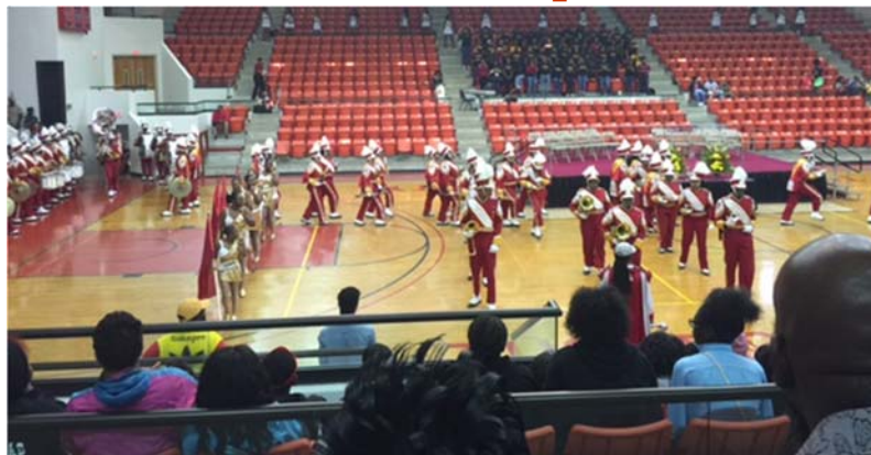
Tuskegee University's Marching Crimson Piper Band